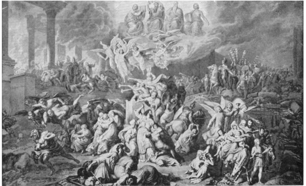
The Destruction of Jerusalem A.D.70

19 And I saw the beast, and the kings of the earth, and their armies, gathered together to make war against him that sat on the horse, and against his army.